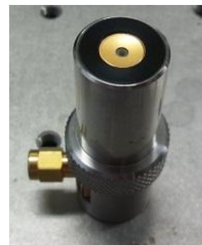
Fig.2 Ultrasound transducer