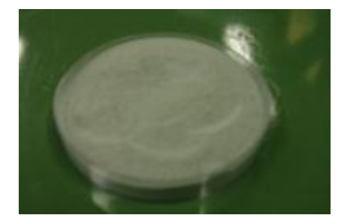
Fig.2 Photograph of green tuff particles.